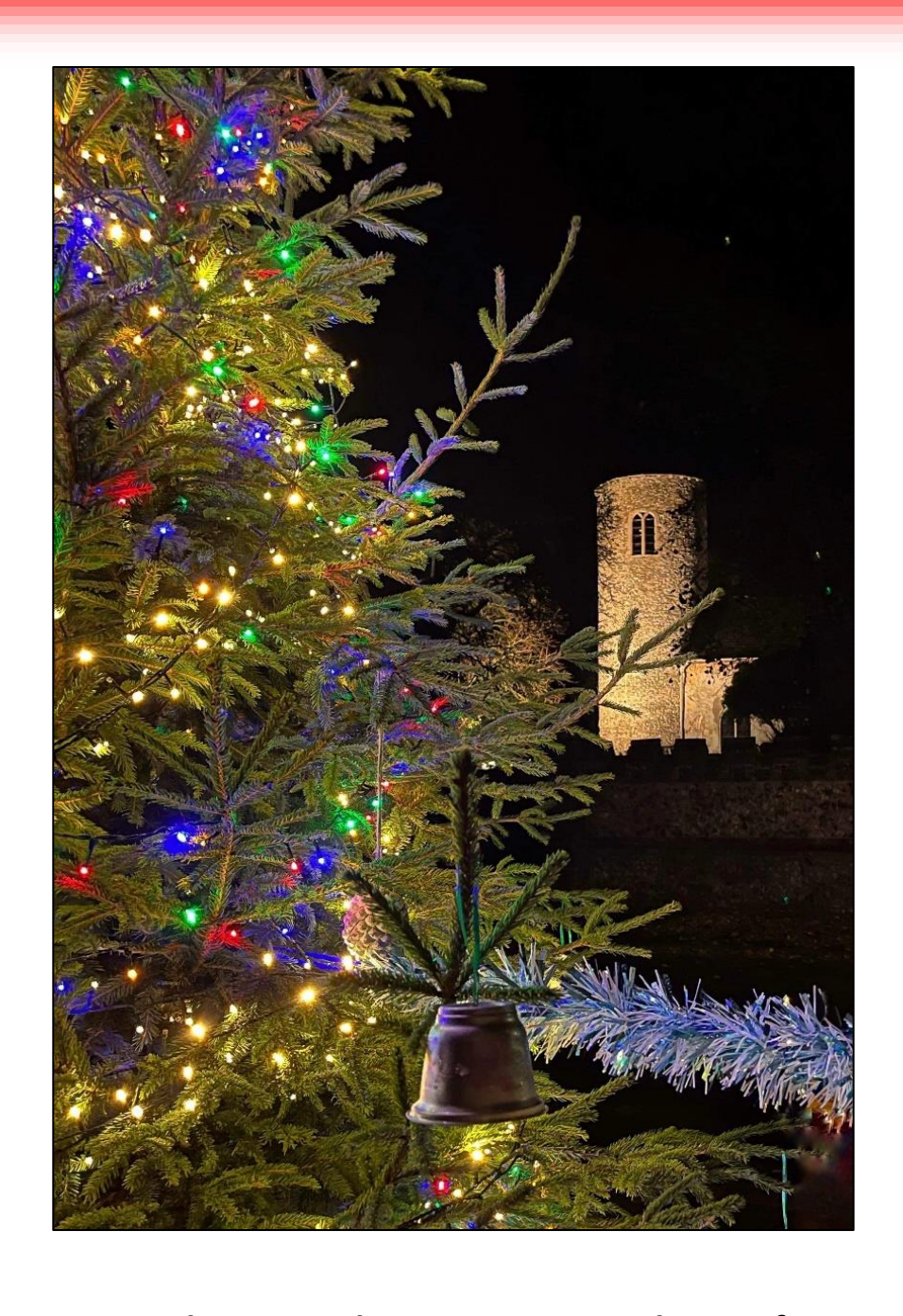
Welcome to the Winter 2023 edition of Syderstone's Natterjack Newsletter