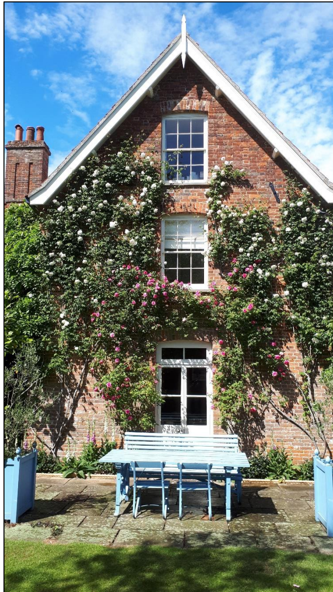
The Old Rectory garden

Welcome to the Spring 2023 edition of Syderstone's Natterjack Newsletter